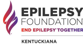
Choice of 1 EFKY Logo Item